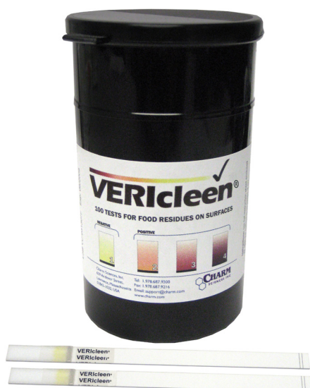
VERiclean Test Kit

“In all cases, the results obtained were consistent and easy to interpret and were attainable within one minute of sampling the surface.” [Figure 1]